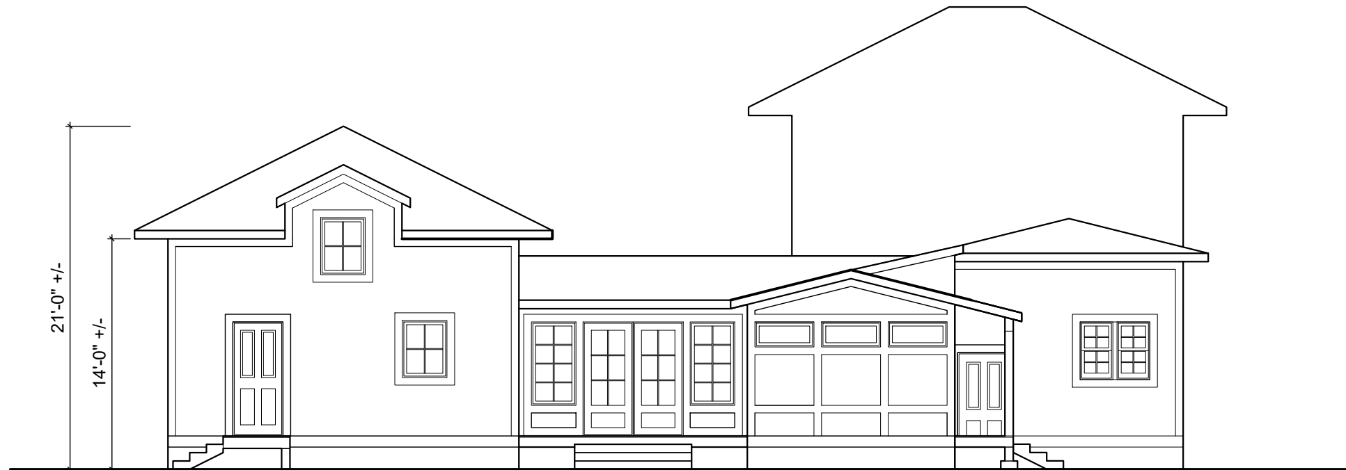
1 WEST ELEVATION A4 1/8" = 1'-0"

KENNEDY HUTSON ASSOCIATES 102 south independence street, p.o. box 74 monticello, illinois 61856 tel 217.762.7466 fax 217.762.3461