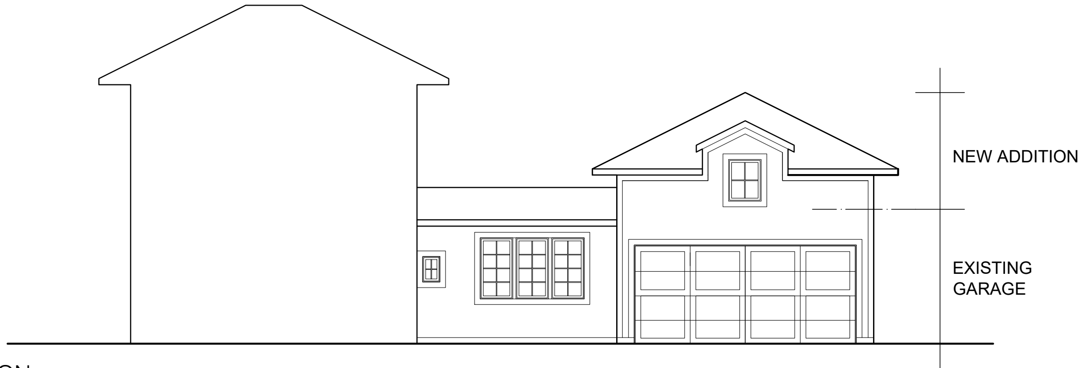
1 EAST ELEVATION A4 1/8" = 1'-0"